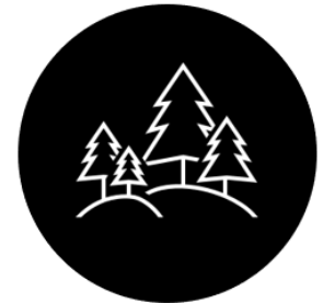
Wood and Bio Energy/Fuel