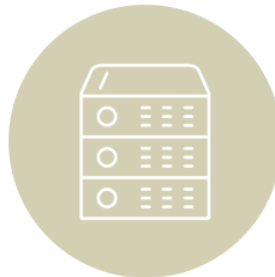
Tech Centres of Excellence